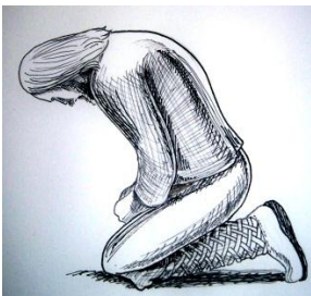
Alfred in Prayer