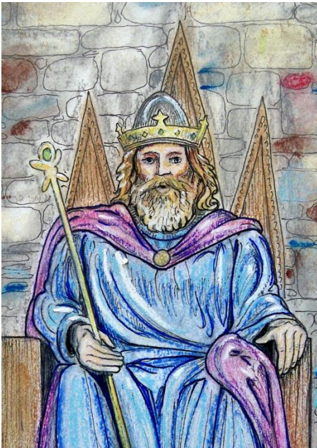
The Father of English Prose

Studying for a Master's Degree in Linguistics, I wrote a paper about Alfred the Great's literacy program which he began in AD 889. I was very impressed and inspired by Alfred's life and decided to write a book based on Asser's Life of Alfred . Working on mother-tongue literacy primers for people in Africa, I stopped several times in England on my way there and visited places connected to Alfred's life. I wrote and illustrated this book hoping that Alfred's life can inspire many more readers to excel in their battle of right versus wrong. Through 84 pages of drawings and text, I tell Alfred's story, highlighting his character and the principles in his life which allowed him to accomplish what very few others have.